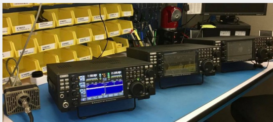
New K4s in Production!

A member of Elecraft Sales Team will contact you by email when your K4 is ready to ship. They will verify your shipping address and provide you with any additional information regarding your order.