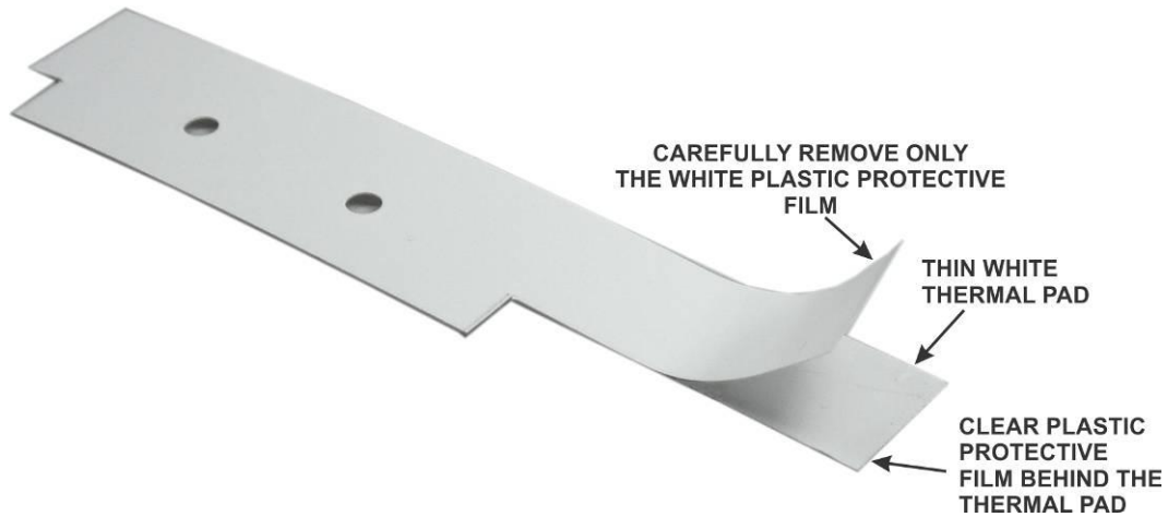
Figure 35. Preparing the Thermal Pad.