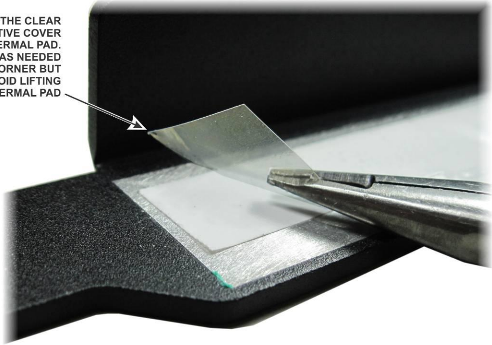
Figure 37. Removing the Clear Plastic Protective Cover from the Heat Sink.

CAREFULLY PEEL THE CLEAR PLASTIC PROTECTIVE COVER OFF OF THE THERMAL PAD. USE A SHARP KNIFE AS NEEDED TO PICK UP ONE CORNER BUT BE CAREFUL TO AVOID LIFTING THE THERMAL PAD